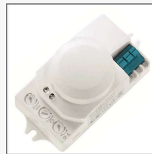
Microwave motion detector